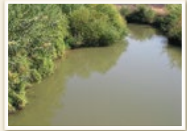
Jordan River North of Sea of Galilee

The highest point in Israel is Mount Hermon, which is 9,232 feet in elevation. Jerusalem is feet above sea level. Just miles from Jerusalem is the lowest point on earth, the Dead Sea, which is feet below sea level.